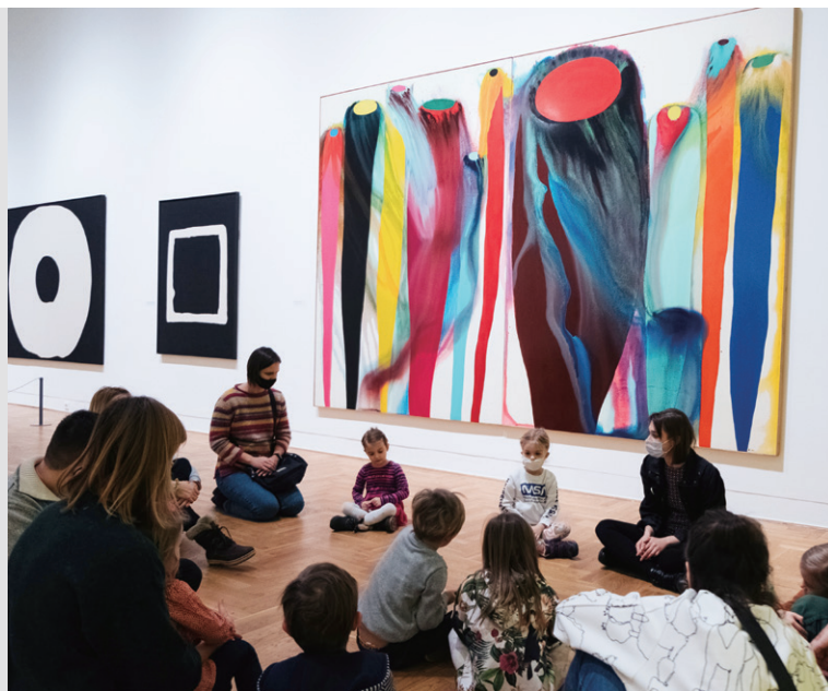
Between Collectivism and Individualism - Japanese Avant-Garde in the 1950s and 60s

Arts and Culture Dept. Film and Broadcast Media Dept.