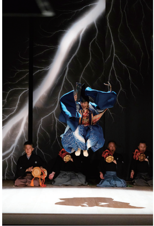
"SAMBASO, divine dance" performed by Mansai Nomura

We create the foundations for promoting cultural and artistic exchange by building on exchanges and collaborations among specialists from various countries and regions. We aim to build a network that underpins exchange and support individuals behind those exchanges by creating dialogue and joint venture activities which transcend national boundaries. This involves inviting and dispatching experts in various fields, such as museum curators, theater and festival directors, publishing editors and translators, or film directors. We also collect information on Japanese culture and the arts, and share them online.